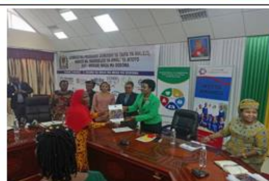
Photo collage of NMECDP Regional Dissemination, clockwise from top left: Kagera; Lindi; Arusha; Rukwa; Dar; Morogoro; Mbeya; Manyara; Dodoma.